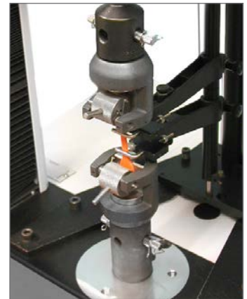
Rubber test on a dual column