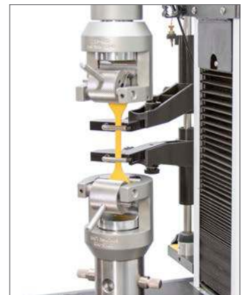
Rubber test on a single column