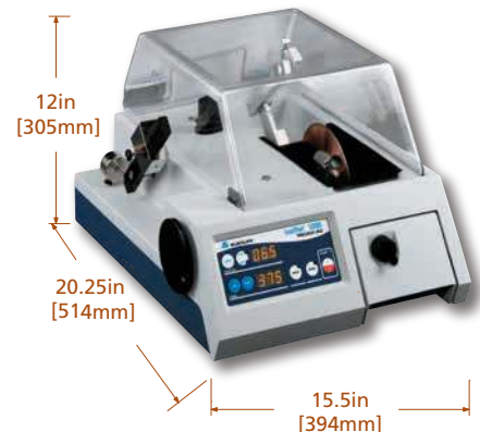
Approx. Weight: 56 lbs [25kg]