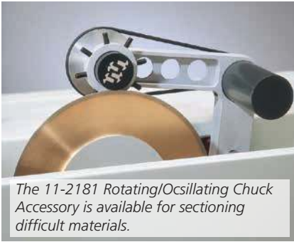
The 11-2181 Rotating/Oscillating Chuck Accessory is available for sectioning difficult materials.