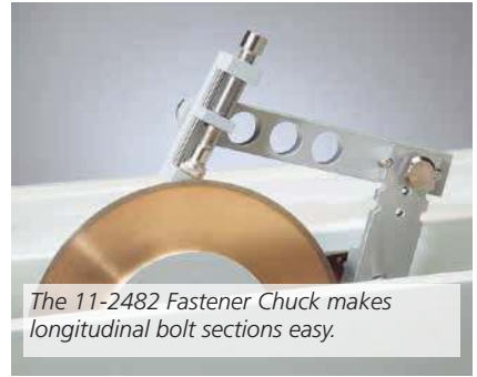
The 11-2482 Fastener Chuck makes longitudinal bolt sections easy.