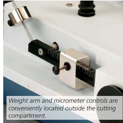
Weight arm and micrometer controls are conveniently located outside the cutting compartment.