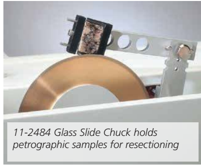
11-2484 Glass Slide Chuck holds petrographic samples for resectioning