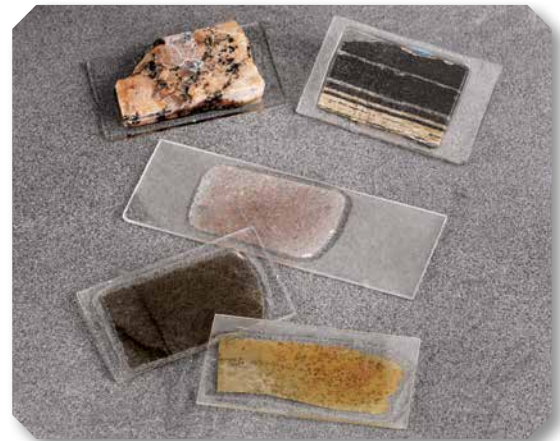
Mineral samples re-sectioned and thinned to 30 \mu\text{m} .