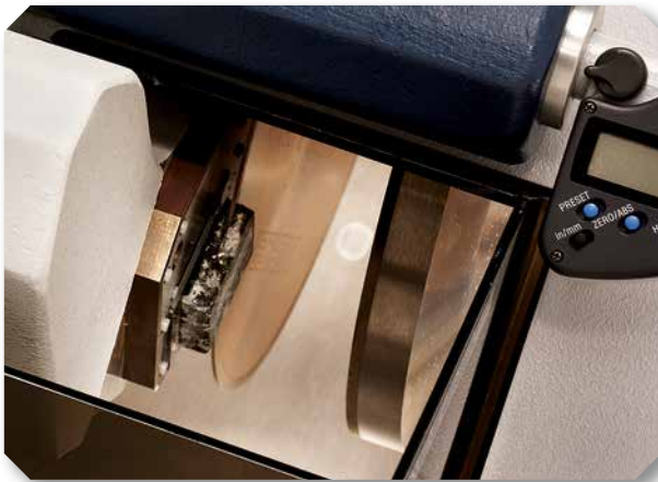
Glass slide mounted specimen resectioned on the diamond cutting blade. The grinding wheel (right) reduces the specimen thickness without having to remove the specimen after resectioning.