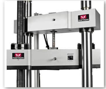
G1 - Closed with Manual Crank and Pinion